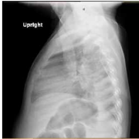
Left: AP CXR. Right: Lateral CXR.