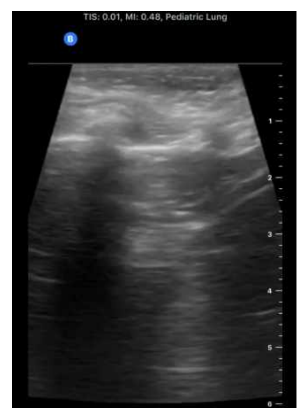
Abnormal side. Additional air bronchograms further identifying the consolidated lung region. With respiration consolidated lung is partially obscured by B lines. Consolidated lung with dynamic air bronchograms